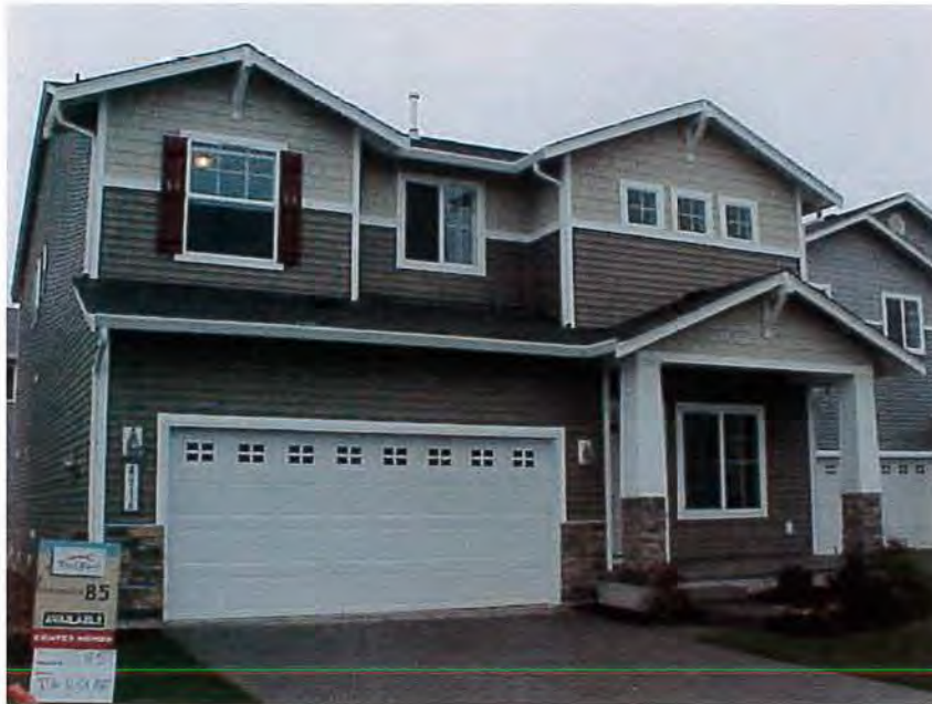
Lot 85 West Face 02-28-08

If using the Elevation Certificate to obtain NFIP flood insurance, affix at least two building photographs below according to the instructions for Item A6. Identify all photographs with: date taken; "Front View" and "Rear View"; and, if required, "Right Side View" and "Left Side View." If submitting more photographs than will fit on this page, use the Continuation Page, following.