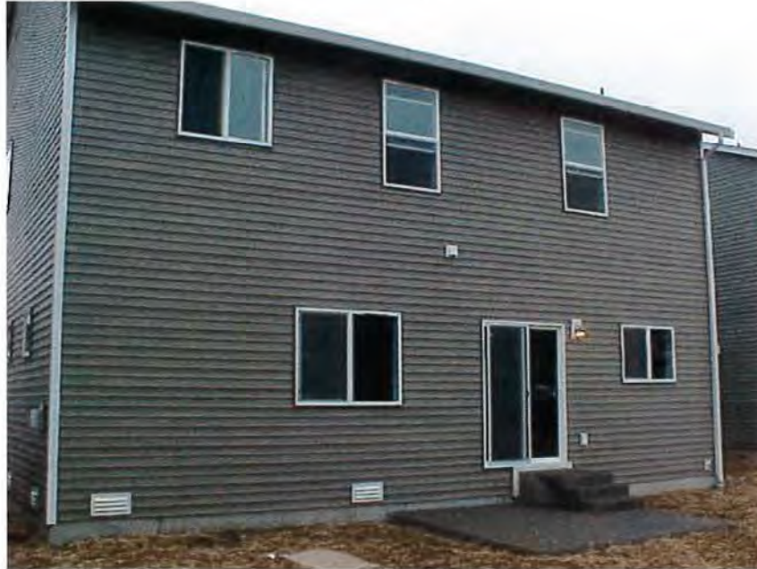
Lot 85 East Face 02-28-08