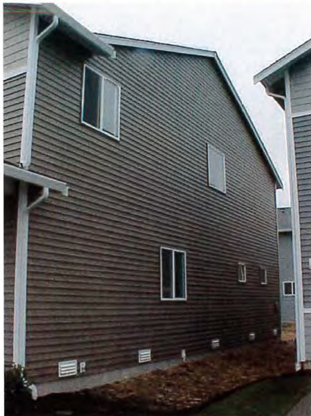
Lot 85 South Face 02-28-08