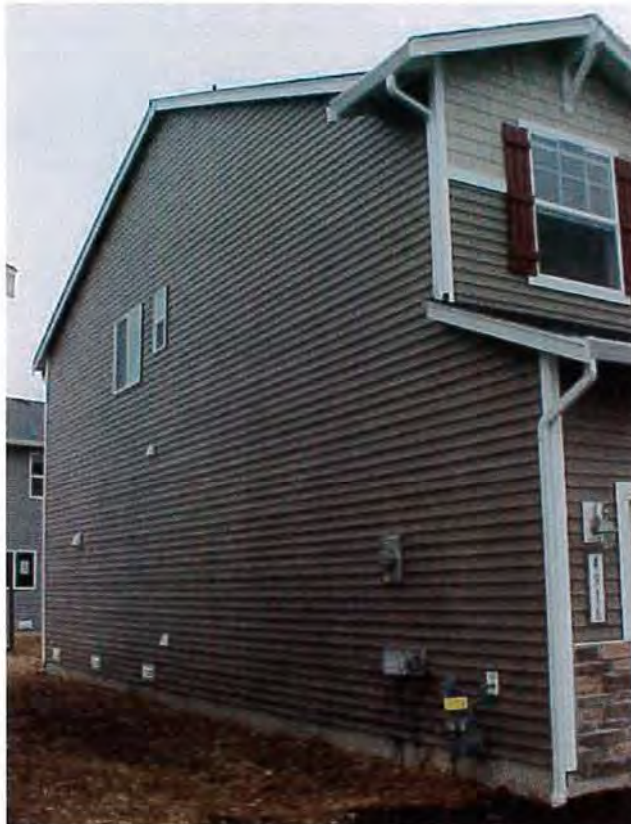
Lot 85 North Face